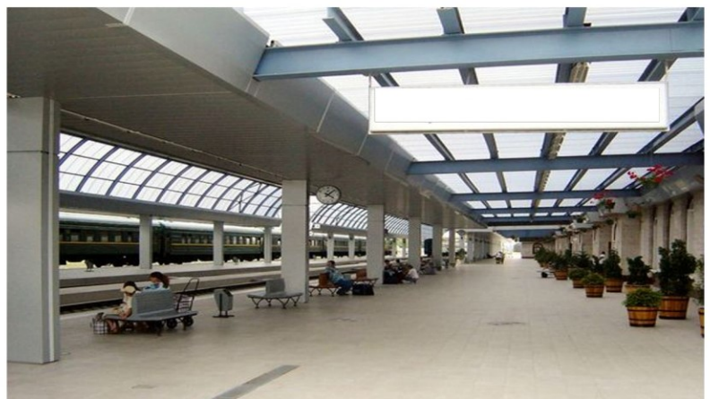
METRO & RAILWAY STATIONS